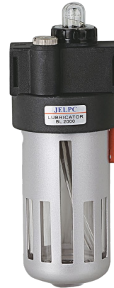
BL (2000 ~ 4000)